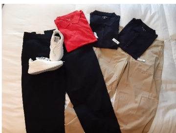
You provided three full uniforms for each student, including shoes. . .