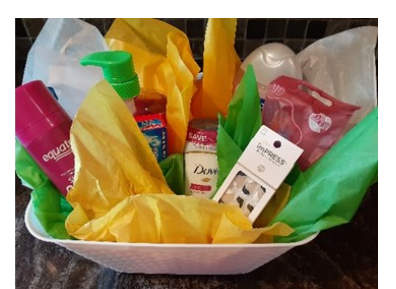
... and toiletries for each.